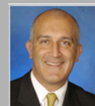
Senator Bruce Starr Hillsboro